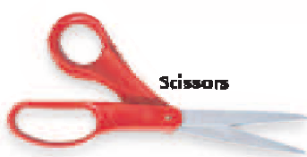
Figure 4 Machines Change the Size and/or Direction of a Force