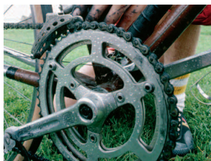
Figure 1 Some Everyday Machines